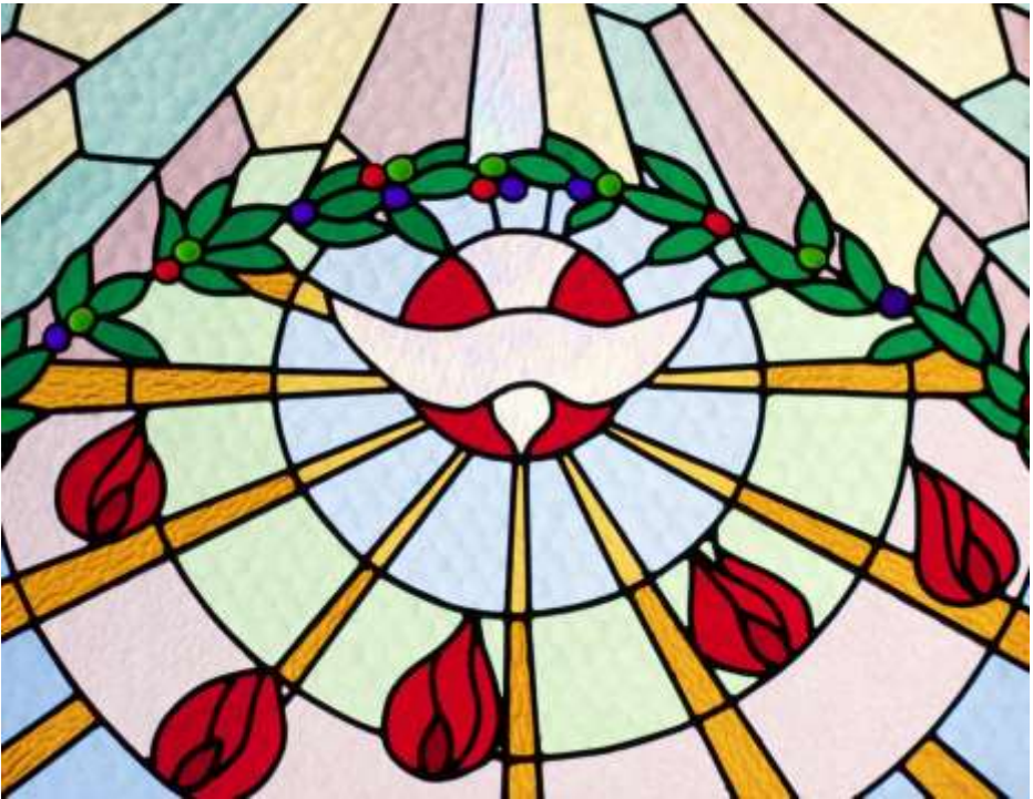
St. Matthew's Haslington

Church and Community News for Haslington and Crewe Green