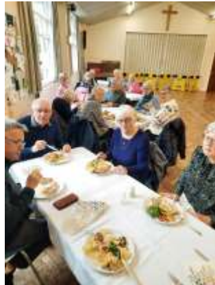
Harvest Bring and Share Lunch Photos of an enjoyable lunch of good food and fellowship