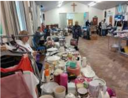
Table Top Rummage sale