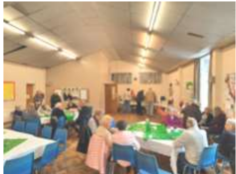
MacMillan Coffee Morning